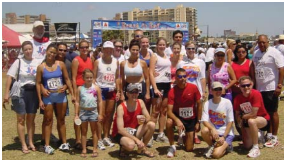
The SMRC usually has several teams participate in the annual Beach to Bay Relay Marathon each May in Corpus Christi.